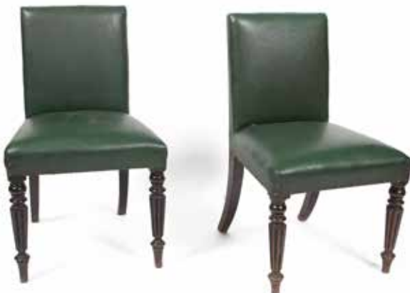
329 A PAIR OF LEATHER UPHOLSTERED SIDE CHAIRS with plain backs and seats raised on mahogany turned tapering fluted legs.