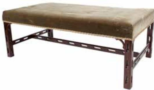
327 A GEORGIAN STYLE MAHOGANY FRAMED LONG RECTANGULAR STOOL the seat upholstered in green fabric, raised on square open pierced supports. 125 x 65cm