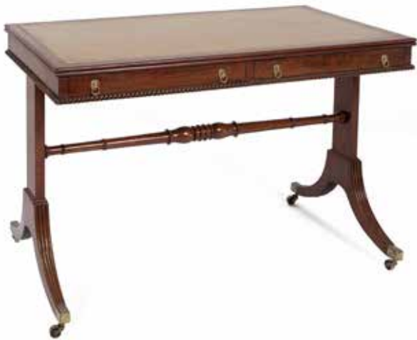
549 A REGENCY STYLE MAHOGANY WRITING TABLE of rectangular form, with tooled leather inset and twin frieze drawers with rope twist moulding, on reeded trestle end supports, 166cm wide