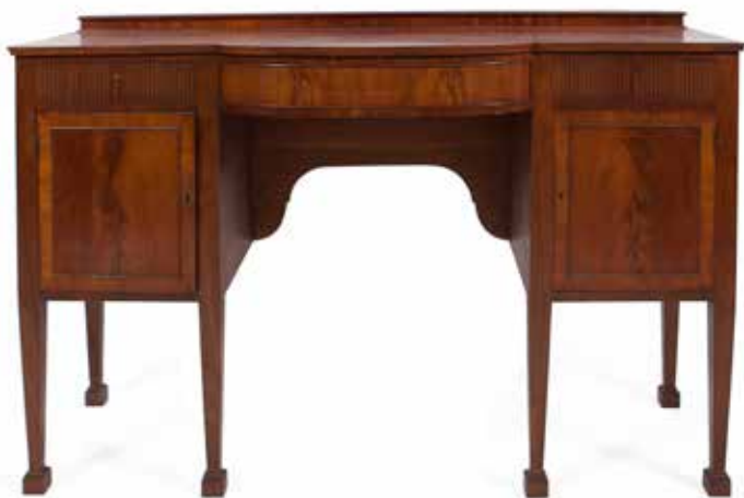
412 AN IRISH GEORGIAN STYLE MAHOGANY COMPACT BOWFRONT SIDEBOARD by James Hicks, 5 Lower Pembroke Street Dublin, the centre frieze drawer flanked by single drawers with reeded facia above panel door cupboards raised on square tapered legs with plinth feet. 137cm wide, stamped.