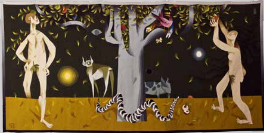
Louis le Brocquy HRHA Adam and Eve in the Garden (1950/51) Est: €80,000-120,000

Auction Wednesday 3 rd December 2014 | 6.00pm