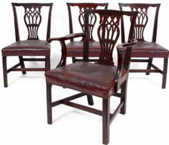
536 A SET OF EIGHT GEORGE III MAHOGANY DINING CHAIRS, comprising of two carvers and six single chairs, each with wavy top rail and pierced splat, red hide seats and squared chamfered supports joined by a H-shaped stretcher.