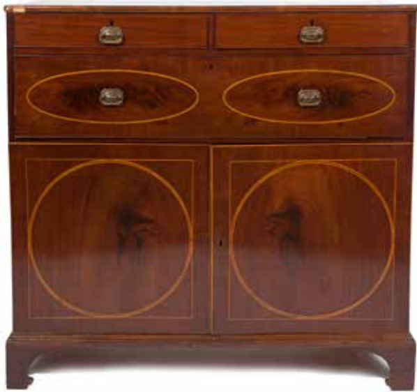
460 A 19TH CENTURY INLAID MAHOGANY SECRETAIRE CHEST, with two short drawers above a secretaire drawer and a cupboard base raised on bracket feet. 124 x 54cm