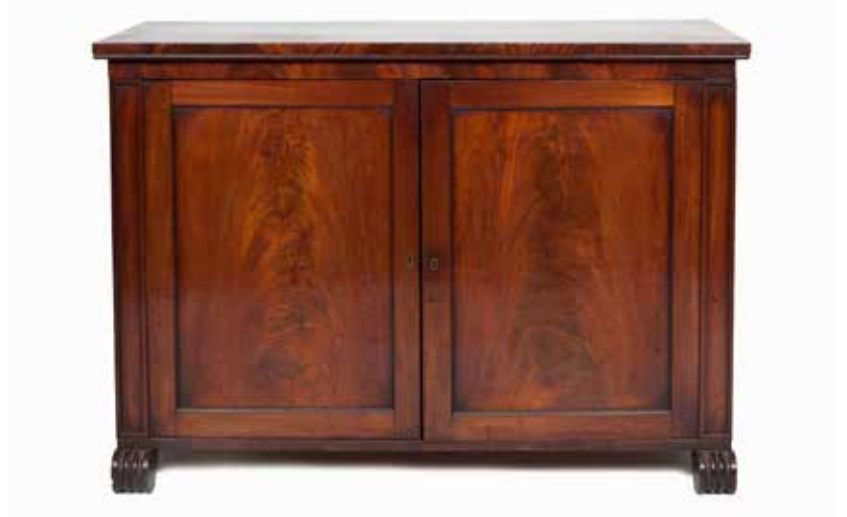
470 A 19TH CENTURY MAHOGANY TWO-DOOR CABINET, of plain design, with fielded panel doors and raised on scroll feet 92cm high x 131cm wide