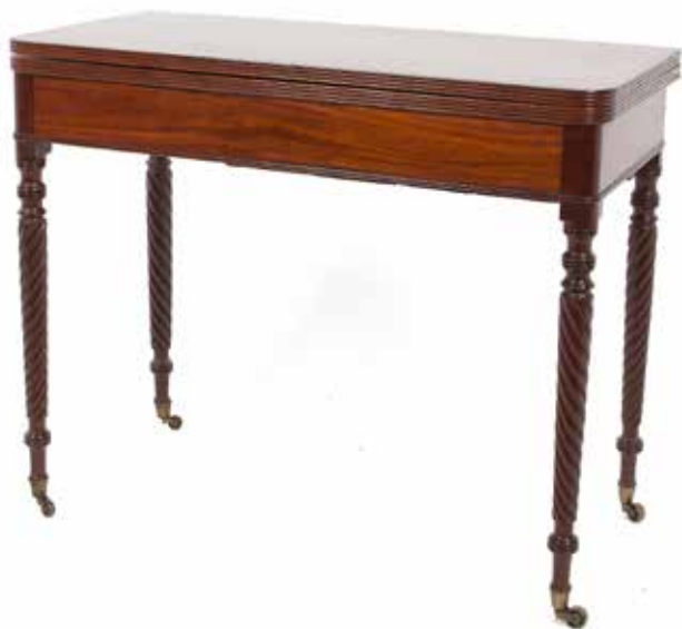
468 AN INLAID MAHOGANY RECTANGULAR FOLDING TOP CARD TABLE, with rosewood crossbanding, raised on spiral turned legs and castors 91cm wide