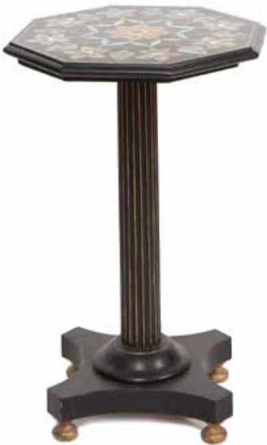
469 A SMALL OCTAGONAL TOPPED OCCASIONAL TABLE, with specimen marble foliate design on reeded timber quadruped base 43cm x 43cm x 69cm high