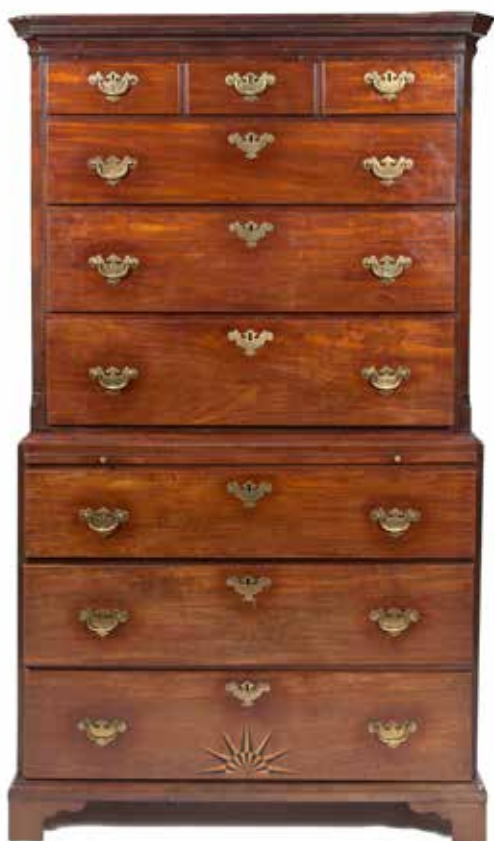
414 A GEORGE III MAHOGANY CHEST ON CHEST the moulded cornice above three short and six long cockbeaded drawers with brass handles, having central pull out brushing slide and canted corners, the bottom drawer with inlaid sunburst motif, raised on bracket feet. 110 x 187cm