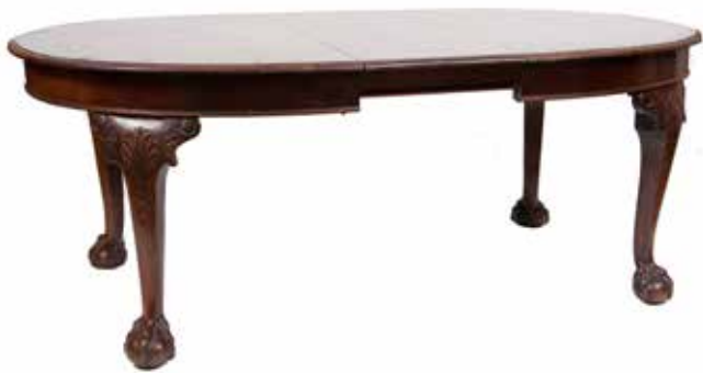
534 A MAHOGANY EXTENDING DINING TABLE OF OVAL FORM, the moulded top on shell carved cabriole legs and heavy ball and claw feet.