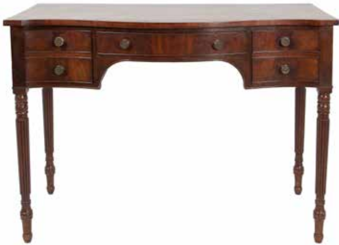
513 A REGENCY MAHOGANY SERPENTINE FRONT SIDE TABLE, attributed to Gillows of Lancaster, the central frieze drawer flanked by two deep drawers with four drawer false fascia, raised on turned fluted legs. 112cm wide, 54cm deep, 82cm high