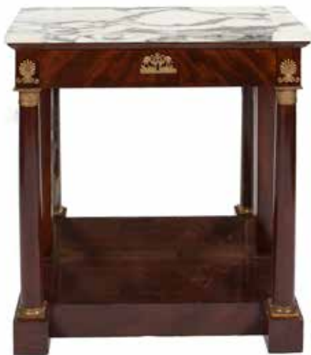
551 A FRENCH EMPIRE MAHOGANY AND MARBLE TOP CONSOLE TABLE, 19th century, the rectangular white marble top above a figural frieze applied with gilt metal mounts and supported on turned columns and platform base. 86cm high, 81cm wide, 38cm deep