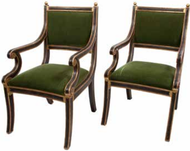
325 A PAIR OF REGENCY STYLE SCROLL BACK ARMCHAIRS, the backs and seats upholstered in green velvet, the rails picked in gilt and raised on sabre legs