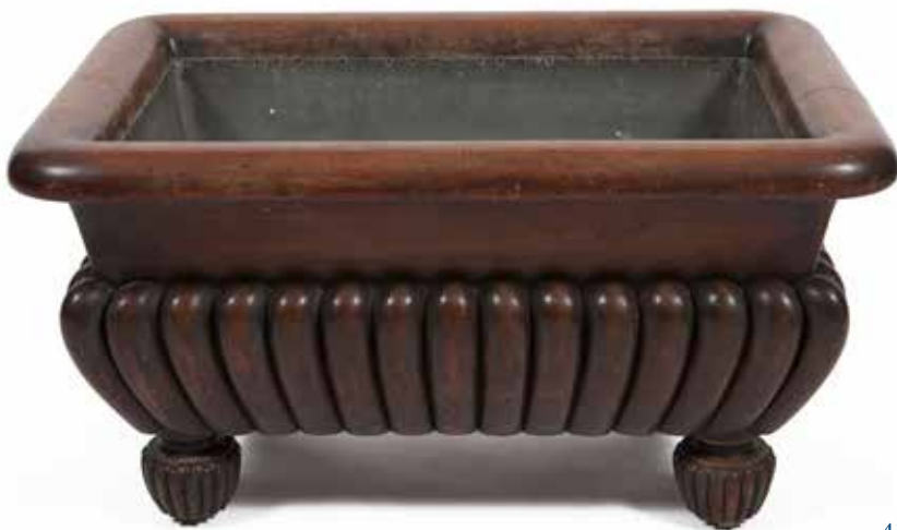
416 A GEORGE IV MAHOGANY WINE COOLER OF RECTANGULAR FORM,

the heavy moulded rim, with lead lined interior above a tapering body with boldly carved flutes, raised on turned fluted baluster feet, with enclosed castors. 86 x 60cm