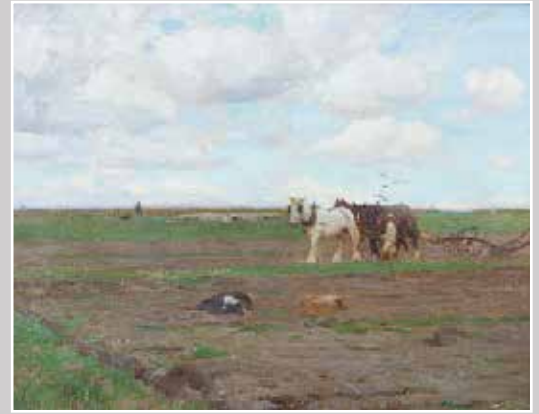
Walter Frederick Osborne RHA Ploughing (c1887/1888) Est: €40,000- 60,000