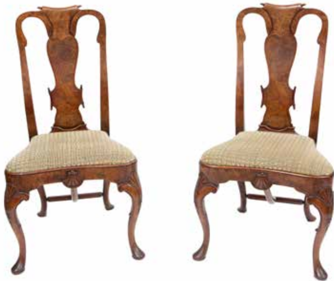
543 A PAIR OF GEORGE II STYLE CHAIRS with vase shape splats, upholstered seats with chequered green fabric, raised on cabriole legs joined by stretcher and on pad feet.