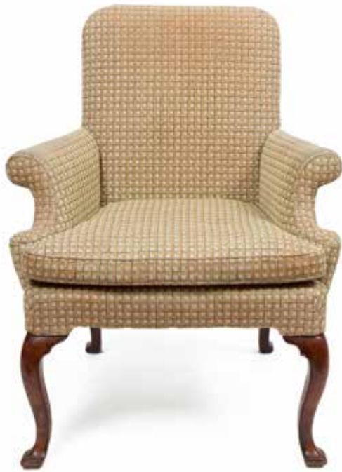
541 A GEORGE II WALNUT FRAMED ELBOW CHAIR upholstered in chequered green fabric, raised on cabriole legs with pad feet.