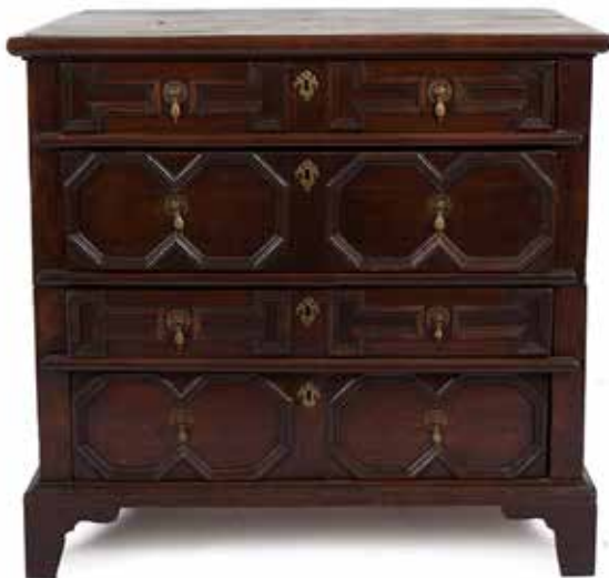
471 A 19TH CENTURY STAINED TIMBER GOTHIC STYLE CHEST

of two short and three long graduated drawers, plain rectangular top, the moulded drawers, with drop-handles, on bracket supports. 102.5cm wide, 55.5cm deep, 99cm high