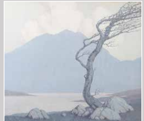
Paul Henry RHA Early Morning in Donegal (1918 - 19) Est: €70,000 - 100,000

FULL CATALOGUE AVAILABLE ONLINE AT WWW.ADAMS.IE