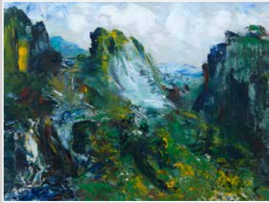
Jack B. Yeats RHA Sleep by Falling Water (1948) Est: €120,000 - 180,000