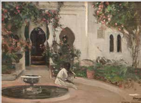
Sir John Lavery RA RHA Boy Sitting by Fountain Est: €10,000 - 15,000