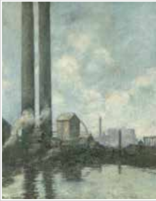
Paul Henry RHA Grand Canal Dock, Ringsend, Dublin 1928 Est: €30,000 - 50,000