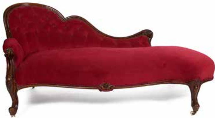
465 A VICTORIAN WALNUT FRAMED UPHOLSTERED CHAISE LONGUE, the moulded frame with scroll arm rest terminals and raised on cabriole legs, covered in buttoned red material. 184cm